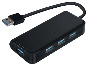
4 in 1 Type-A HUB (4 x USB 3.0) Unique design, Plug and Play