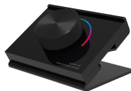
6379 1 Zone RGB

Rotary dimming/1-3 color/Wireless remote 30m distance/CR2032 battery