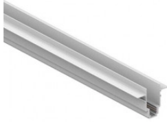
R35-B BUILD-IN SKU: 5420,5421,5422,5255,5256,5257